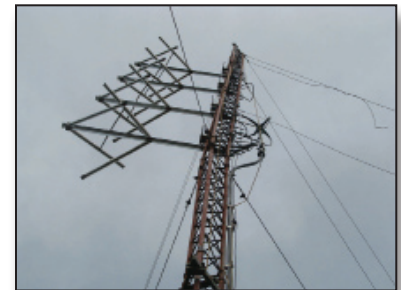
Lighthouse Radio tower bent from rust eating through the metal

Jones as they are in desperate need of a new tower. The current tower is eaten almost through with rust and they are in the typhoon season. He needs $18,000 to put in a new 150' tower specially treated for