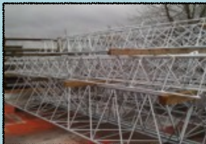
SAMAR, PHILIPPINES By the time that you are reading this, the new tower for 104.5 fm will be well on the way to its new home.